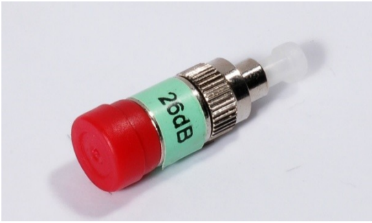
FC/UPC fiber optic attenuator