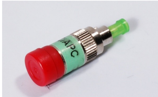
FC/APC fiber optic attenuator

Other plug type attenuator,SC,FC,ST,LC,MU types,UPC,APC types available.