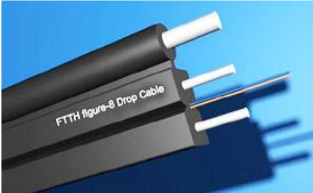
FTTH Drop cable