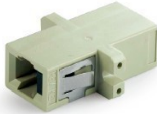
MT-RJ Adapter with SC Footprint