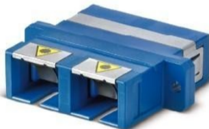
SC Duplex, with Internal Shutter