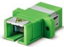
SC Simplex, w/Flange and Internal Shutter