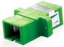
SC Simplex, w/Flange

Simplex standard SC fiber optic adapters