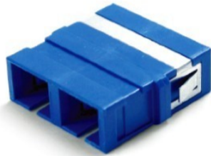
SC Duplex, w/o Flange, Horizontal Type