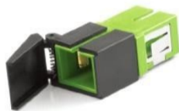
SC Simplex w/o Flange and External Shutter