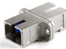
SC Simplex Horizontal Adapter Rectangular Flange with Metal Housing