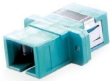
SC Simplex, w/Flange