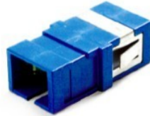
SC Simplex, w/o Flange