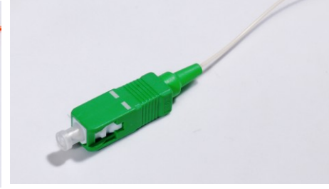
Single mode SC/APC pigtail