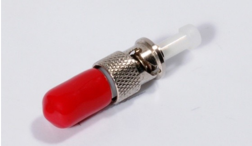
ST/UPC fiber attenuator