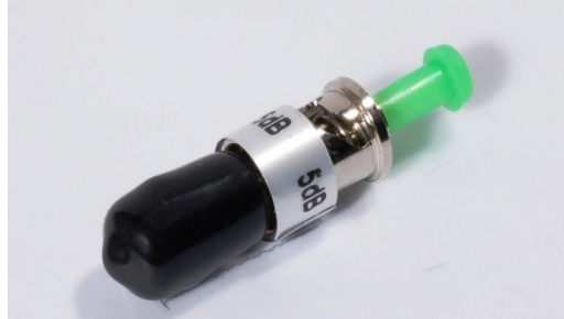
ST APC fiber attenuator

Other plug type attenuator,SC,FC,ST,LC,MU types,UPC,APC types available.