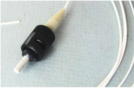
Single mode ST/UPC pigtail